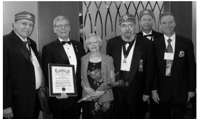
The Albany Contingent