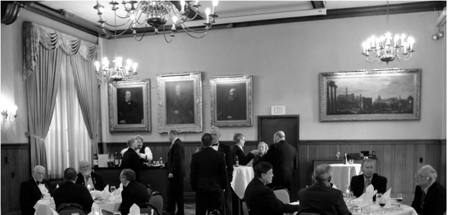
Small group but mighty!