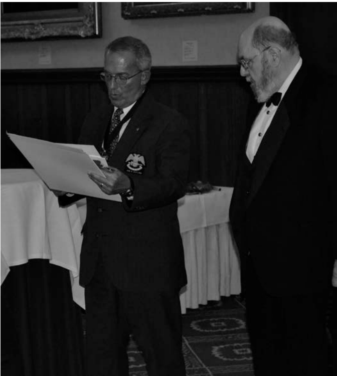
Time for awards