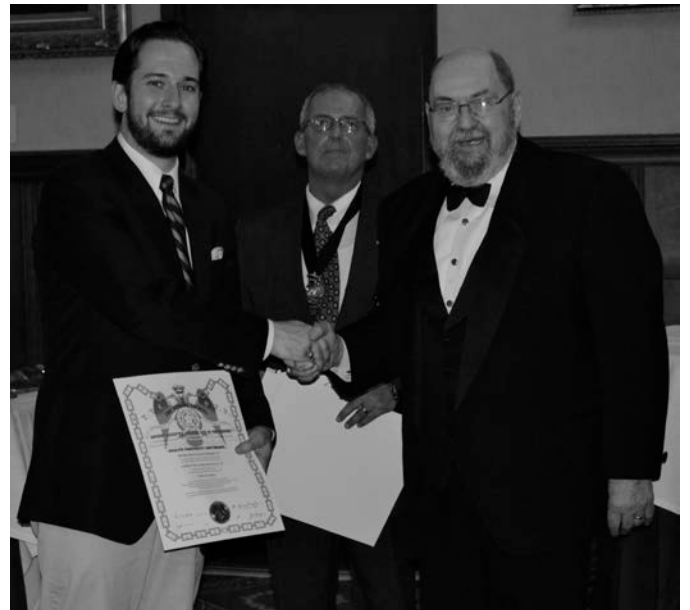
And a Winner is...