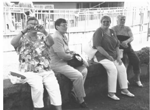
The Wall Sitters

Ed. Note: It poured that day until we got out on the lake and then the Sun shone brightly!