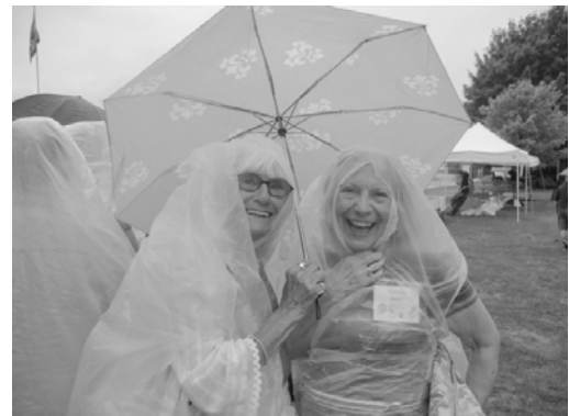
Bags in Bags